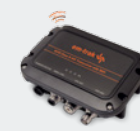
AIS Class B with WIFI B330